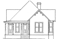
Queen Anne Cottage